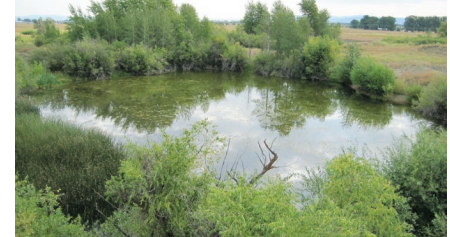
A survival, evasion, resistance and escape specialist performs a static line parachute jump above Fairchild AFB (top). This project prevents retention ponds (bottom) that can attract birds or wildlife that present a bird aircraft strike hazard.